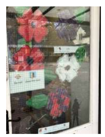
Remembrance Day decorations Throughout school, students have been learning about many aspects of WW1 and created some beautiful art work.